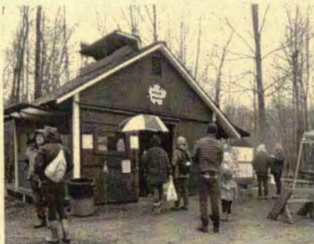
At the Sugar Shack