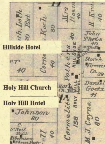
Richfield Township 1915 Plat Map

The Hotel and Livery owned various rigs, some three- and four-seaters, and a buggy bus that held twelve to fourteen passengers. The approximately two and one-half hour trip from the Dickel Hotel to Holy Hill cost fifty cents. 19 Those were rough days for Benny as he’d sit in an open buggy or sleigh from 7:00 in the morning until 6:00 at night, many times in 20 below zero weather.