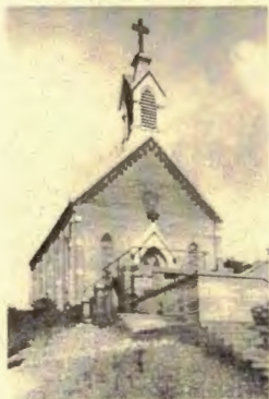
The Church at Holy Hill, 1923