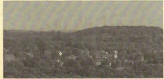
View from the top of Holy Hill, looking south toward Milwaukee (in background), August, 2020

According to history, in 1858, the Blessed Virgin Mary appeared 18 times, from February 11-July 16, to Bernadette Soubirous, a 14-year-old miller's daughter from the town of Lourdes in southern France. 33