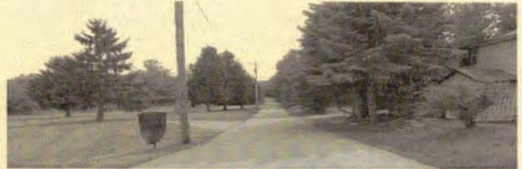
Stations Way: Looking South on Stations Way from Hwy. 164, (September, 2020)

The only road leading to the shrine church was at the stone arched gate. A short distance from the gate was the first station. 24 The road leading to the stations of the Way of the Cross had become known as Stations Way.