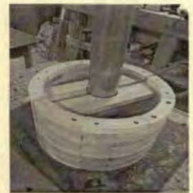
Top – Old Sheave Bottom – New Sheave