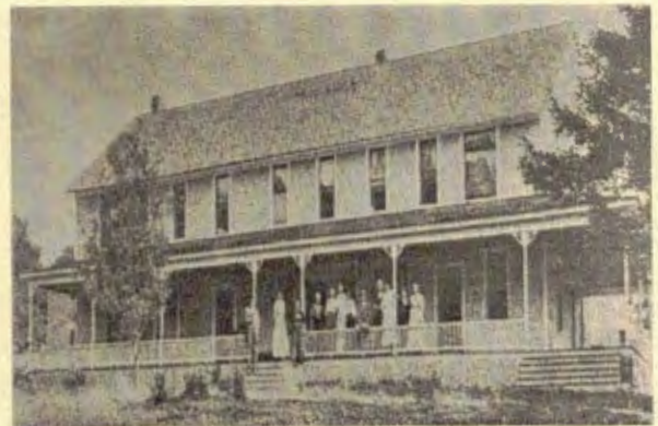
Hillside Hotel, later owned by Math. Stuetgen 12

Luckily, your family on its visit to Holy Hill was able to secure sleeping accommodations at a large dormitory and dining hall called the Holy Hill Hotel. The Holy Hill Hotel, formerly a parsonage, overlooked a ravine and was opposite the third station. 13 ( ...of the fourteen Stations of the Cross. )