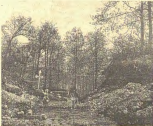
Stations Way: An Earth-Cut On The Ascent 25