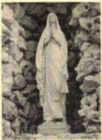
Blessed Virgin Mary, Lourdes Grotto