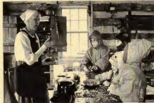
Pioneer Homestead Learning