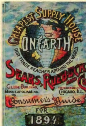
First Sears Catalog

Retail Sears stores spread across the country, and sales remained strong even during the Great Depression. But by the 1990s, Sears began to struggle as the company confronted competition from rival discount department stores including K-Mart, Target, and Walmart; as well as economic woes brought on by the Great Recession and the increasing dominance of e-commerce. Sadly, after 132 years in business, former retail giant Sears filed for bankruptcy in October 2018, announcing it would close 142 unprofitable stores due to the mounting competition from big-box stores and, of course, Amazon.com. In 1993, Sears announced it was closing its catalog division, ending a storied era of mail-order bargain-hunting and wish fulfillment that had begun nearly a century earlier. The Sears Tower sold in 1994; and in 1998, the Sears Christmas catalog went online for the first time at Wishbook.com , a year before the Sears.com website was launched. Despite a brief return to profitability after a merger with Kmart in 2005, Sears continued to struggle. By the time it filed for bankruptcy, Sears had lost more than $11 billion since 2011 , even after trying to cut costs by closing hundreds of its retail stores across the country.