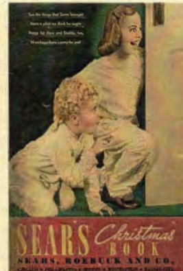
First Christmas Book 1933 (changed to “Wish Book” 1968)