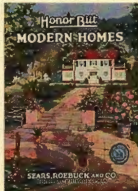
First Modern Home Catalog (available 1908 – 1914)