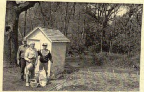
Planning the Garden

Adopt a Flower Garden: The gardens in front of the Mill kiosk and the area around the Wood Shed have been "adopted." There are other flower gardens that need help, especially around the Mill House & Horse Shed. You don't have to be a gardener; we have folks who can show you what to pull etc. Also, you are able to work in some of them sitting down! If you are able to help on planting day at the end of May (weather dependent) or any other time in either the vegetable or flower gardens, contact Daryl Grier, 262 628-4221, dgrier@charter.net .