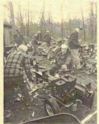
Thursday Crew Cutting Wood