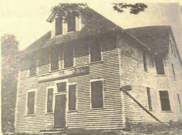
Holy Hill Hotel Richfield Remembers the Past 14